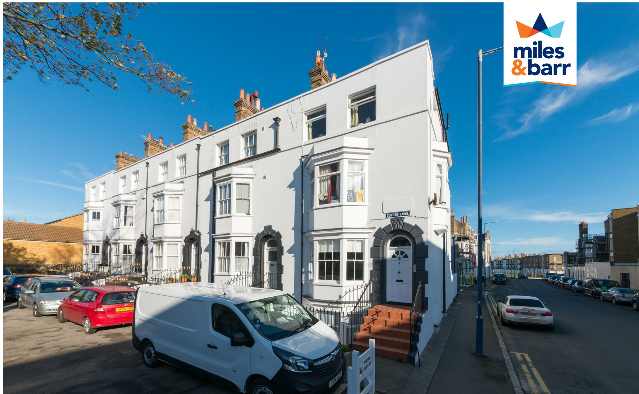
1C CLIFTON LAWN RAMSGATE